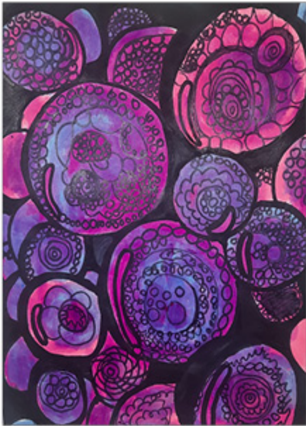
ABOVE: Rozlynn, Eastern Heights Elementary, grade four.