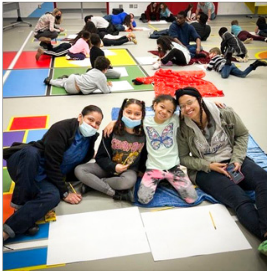
Second-grade students, staff and families gathered at Hamilton Elementary School to learn all about maps!