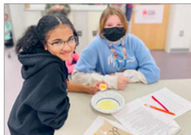
Classrooms at Ely Elementary School were celebrating 100 days of school (above) and the 2/2/22 anomaly of February 2, 2022 (below).